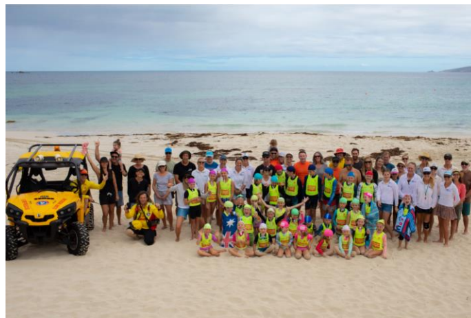
Club Photo 2019-2020

We hope you and your family will be active and enjoy the benefits of being members of this great club. If, at any time throughout the season you have a question, please feel free to approach any member of the board listed in this handbook.